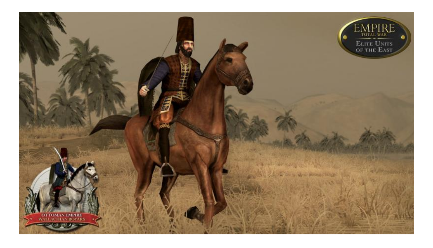
Download ->->-> <a href="http://bit.ly/2JZN2Ao">http://bit.ly/2JZN2Ao">http://bit.ly/2JZN2Ao</a>